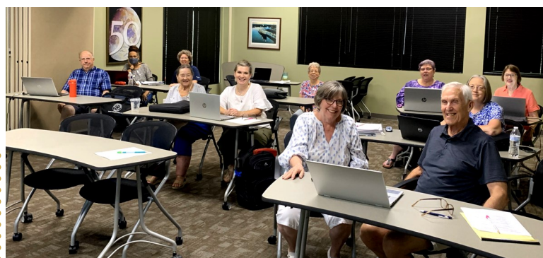
In-Person Spotlight at the Friendswood Public Library

National Genealogical Society, Texas State Genealogical Society, Clayton Library Friends, and International German Genealogy Partnership